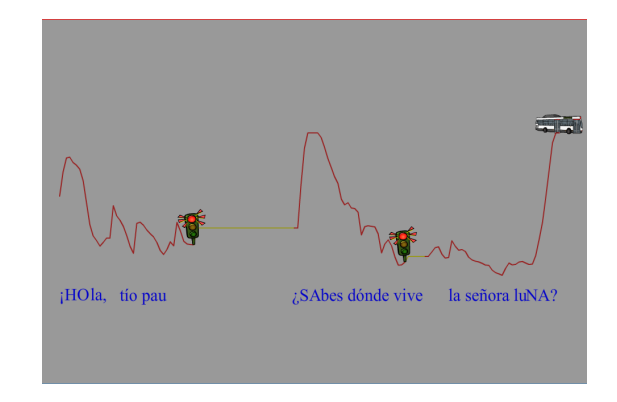
Figure 3: Prosodic activity. The user has to reproduce the intonation contour and to make the breaks at the traffic lights.

The activities are included in the general context of the game and players need to do them in order to progress in the game. All the activities have been planned according to the principles of learning that have proven most effective for teaching and presenting information to people with intellectual disabilities [3, 4].